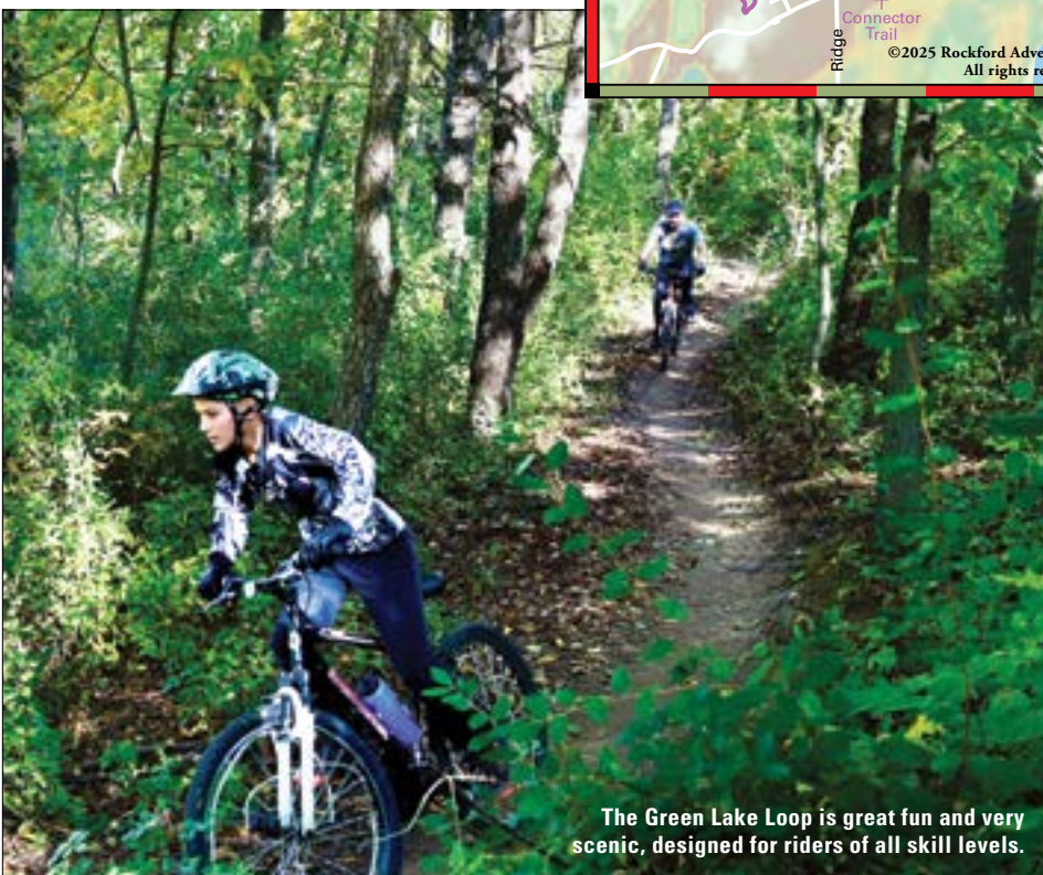
The Green Lake Loop is great fun and very scenic, designed for riders of all skill levels.

Designed to be "the Midwest's most epic mountain biking trail system," each of the four singletrack trail loops were built one year at a time, branching off from one another, and completed in 2019. Professionally designed and built as sustainable "flow" trails, you will appreciate the attention to detail that went into every inch of these trails.